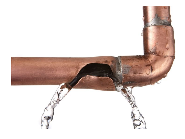
Rupture in copper pipe

When a pipe is suddenly closed at the outlet (downstream), the mass of water before the closure is still moving, thereby building up high pressure and resulting in a shock wave. The result may be heard as a loud bang, repetitive banging (as the shock wave travels back and forth in the plumbing system), or as some shuddering. A water hammer can cause pipelines to break if the pressure is high enough. A water hammer may occur when the water supply valve inside the humidifier shuts off the water flow. The hammering action is capable of damaging joints, causing connections to come loose, and causing ruptures and connections in the pipe.