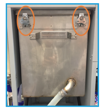
Disengage the clamps