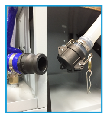
Disconnect the water inlet