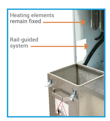
Drop down evaporation chamber with rail-guided system